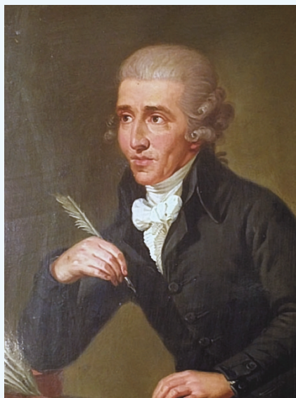
Portrait by Ludwig Guttenbrunn, painted circa 1791–92, depicts Haydn around 1770

In Haydn’s hands, the piano, violin, and cello engage in lively exchanges, blending lyrical melodies, conversational interplay, and dance-like rhythms into a bright and harmonious whole.